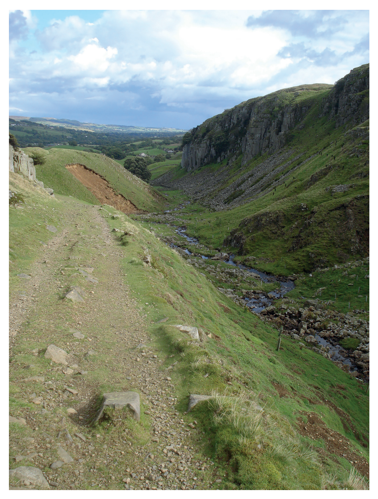
Fig. 4.2 for Question 4